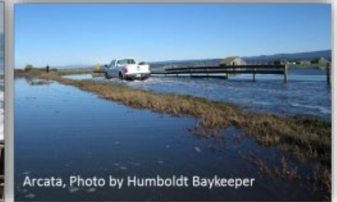
Arcata, Photo by Humboldt Baykeeper

Original Guidance unanimously adopted – August 12, 2015 Science Update unanimously adopted – November 7, 2018