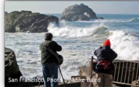
San Francisco