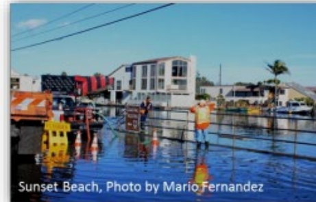
Sunset Beach

Interpretive Guidelines for Addressing Sea Level Rise in Local Coastal Programs and Coastal Development Permits