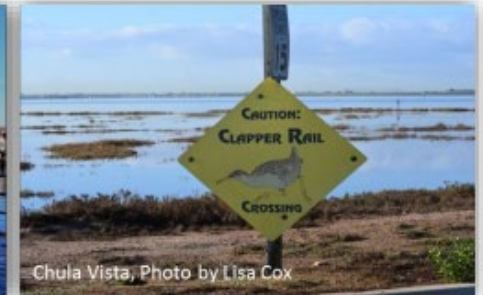
Chula Vista